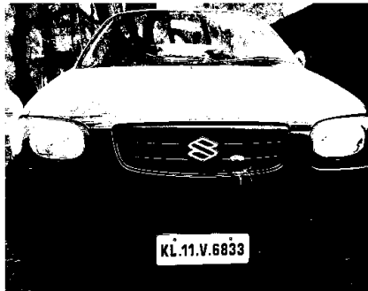
Figure 2. Output of Otsu's Algorithm

Input image of the number plate is pre-processed for the removal of background noise. The pre-processed image is binarized to make it suitable for localising the number plate. Otsu's algorithm [5] is employed to for fast binarization. The output of Otsu's algorithm is given in figure 2. This binarized image is used as a input in localization of license plate.