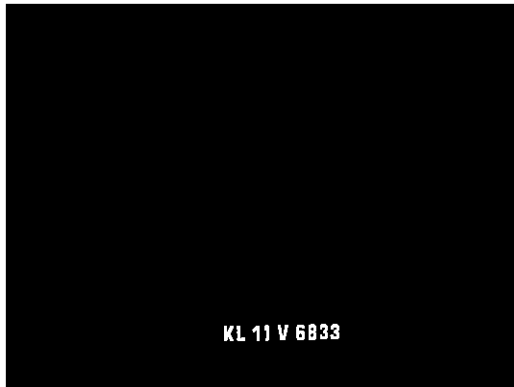
Figure 5.Final Result after Position Filter