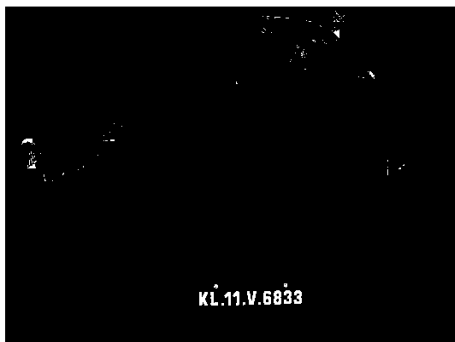
Figure 3. Output of Inverted 'L' masking

Figure 3 shows output of Inverted L masking.